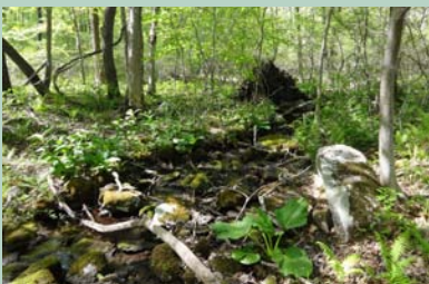
Strong Preserve stream course

We are very excited to announce our newest acquisition: The Strong Preserve! This 53-acre parcel off of Above All Road was purchased in the fall by the WLT with the generous assistance of a consortium of conservation-minded neighbors. Just a half-mile from the center of town, the wooded preserve features streams that discharge into Lake Waramaug, as well as a knoll that is one of the highest elevations in Warren. The property contains second growth forest, numerous stone walls, and an impressive stand of mature oak trees. It provides habitat for black bear and bobcat, as well as sensitive forest-interior birds such as wood thrush, scarlet tanager, and ovenbird. We are working to establish a hiking trail on the Strong Preserve with the pro bono assistance of Bill Pollack of Arbor Services of Connecticut, along with a small parking area. We will keep you updated on progress, and hope to see you out on the trail sometime this summer!