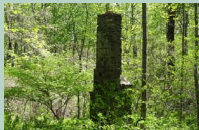
Strong Preserve chimney ruin