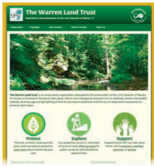
A sample of our smart phone friendly new website

The Warren Land Trust's mission focuses on land conservation and preservation...but that doesn't mean we don't understand the importance of staying abreast of new practices and technologies that serve that mission – whether those be smart-phone GPS mapping applications, or ways of connecting with our community. We have educated ourselves about and are working to implement the former; and we are embarking upon the latter in a number of ways. First, as you may have noticed if you have provided us with your email address, we are sending out news and updates via email blast. We use this mode of communication judiciously and sporadically: we don't want to flood your inbox, but rather seek to inform you when we have news to relate. We have also set up a Facebook page – we encourage you to check it out and “like” us! We post twice a month – more frequently if we have more to share. Content sometimes replicates