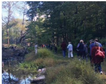
Attendees walking along one of the beaver ponds on the preserve.