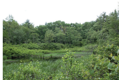
The Cranberry Bog